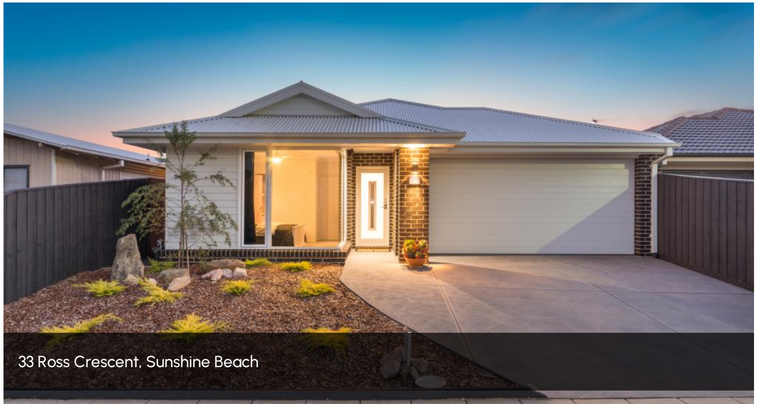
33 Ross Crescent, Sunshine Beach